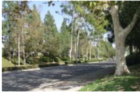
Landscaping along major streets adds significantly to the attractiveness of Yorba Linda and provides a variety of benefits for local property owners.

Many landscaped areas in town are on easements dedicated to the City of Yorba Linda, including on property that's adjacent to homes. While the City doesn't directly own the land, we do determine how it can be used and are responsible for maintaining the landscaping. Only City-authorized personnel are allowed to trim trees and maintain the landscaping located on these easements.