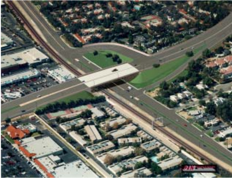
This rendering of the Imperial Highway "grade separation" shows the ramps that will provide access between Imperial and Orangethorpe/Esperanza. The bridge is similar in design to ones already in place on Fairmont and Yorba Linda Boulevards.

Caltrans contractors have begun construction of a bridge on Imperial Highway that will eventually span Orangethorpe Avenue/Esperanza Road and the adjacent railroad tracks. Efforts to install a "grade separation" at this location have been underway since the late 1990's.