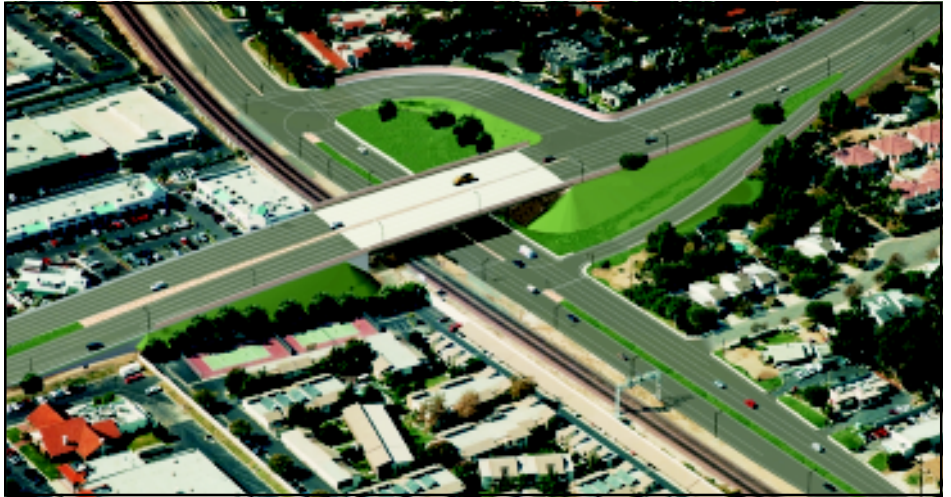
Proposed Imperial Highway overcrossing

Imperial Highway spans four miles through Yorba Linda and is highly regarded for the aesthetics and improved traffic flow thanks to significant improvements made five years ago. Imperial Highway represents a major ingress and egress point for Yorba Linda. As a result, the City will continue to ensure that this thoroughfare is well maintained.